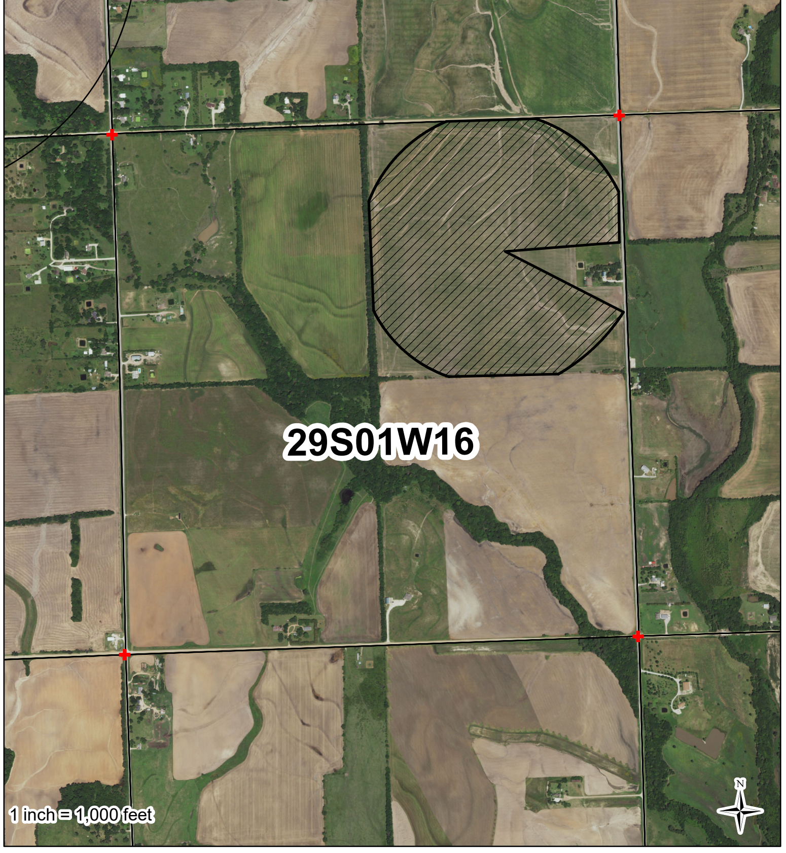
I declare that all water wells or diversion sites using the same source of supply and within ½ mile of the proposed point of diversion have been plotted on the application map. ProposedPD

ProposedPlaceOfUse Signature Date ♣ Water Rights 0 400 800 1,600 2,400 3,200 ♣ SFFOsec_corners Feet