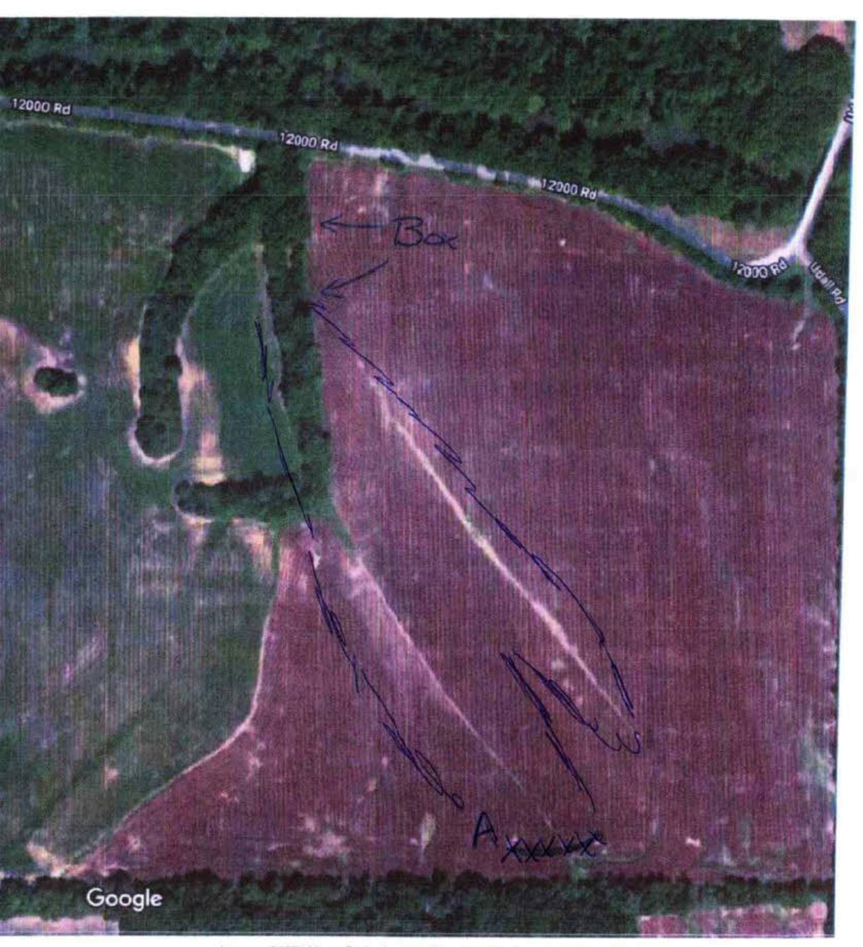
Imagery #2022 Maxar Technologies, USDA Farm Service Agency, Map data #2022 200 ft